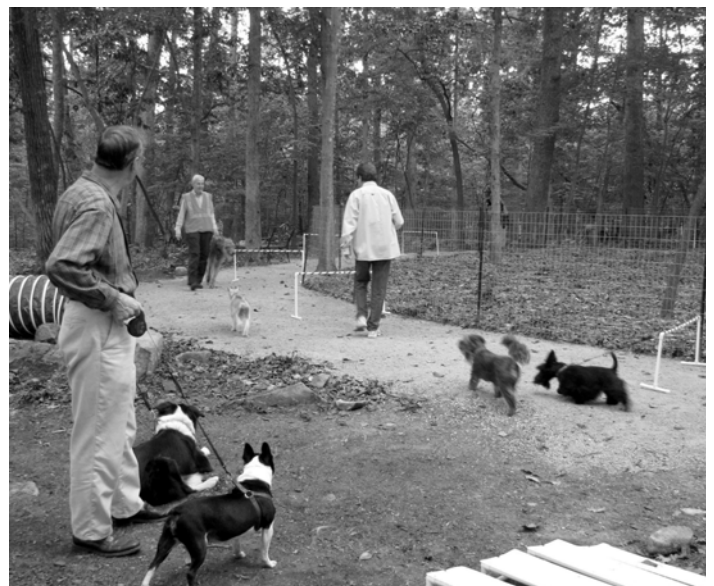
A great day to explore the park