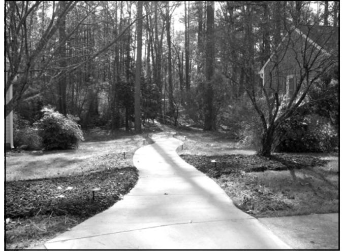
Heading towards Coventry

Nonprofit Org. U.S. Postage PAID Chapel Hill, NC Permit No. 258